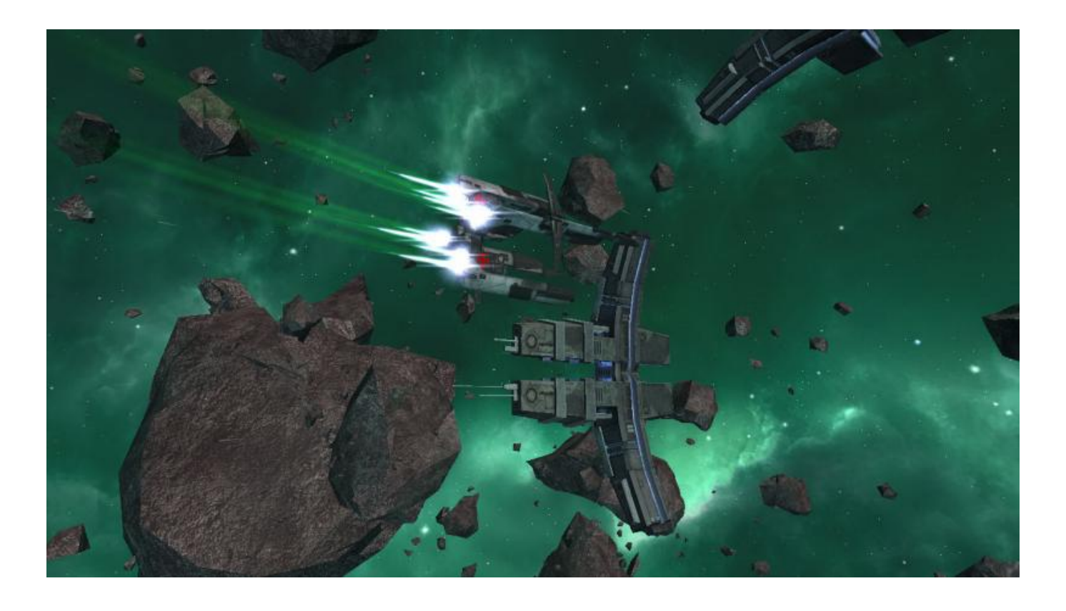
Star Wolves 3: Civil War Download Code

Download >>> <a href="http://bit.ly/2NHIPFt">http://bit.ly/2NHIPFt</a>